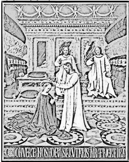
Jean Fouquet, Coronation of the Virgin , 15th century

https://www.ewtn.com/catholicism/seasons-and-feast-days/queenship-of-mary-22577