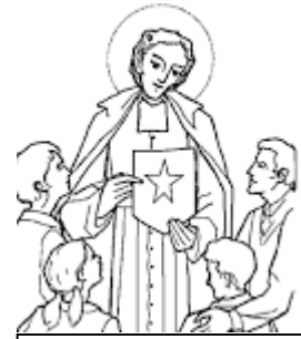
Statue in the Church of Saint Jean-Baptiste de La Salle, Paris, France

https://en.wikipedia.org/wiki/Jean-Baptiste_de_La_Salle